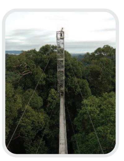
Single Spandeck provides walkway to observation tower in Brunei rainforest.