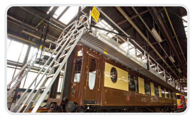
Spandeck used to gain close access for maintenance to the roof of the Famous Orient Express.