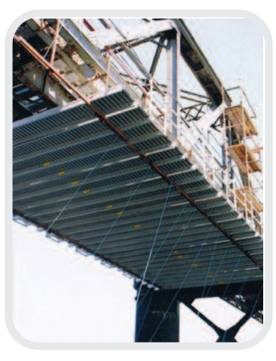
Linked Spandecks provide a platform for under bridge refurbishment.