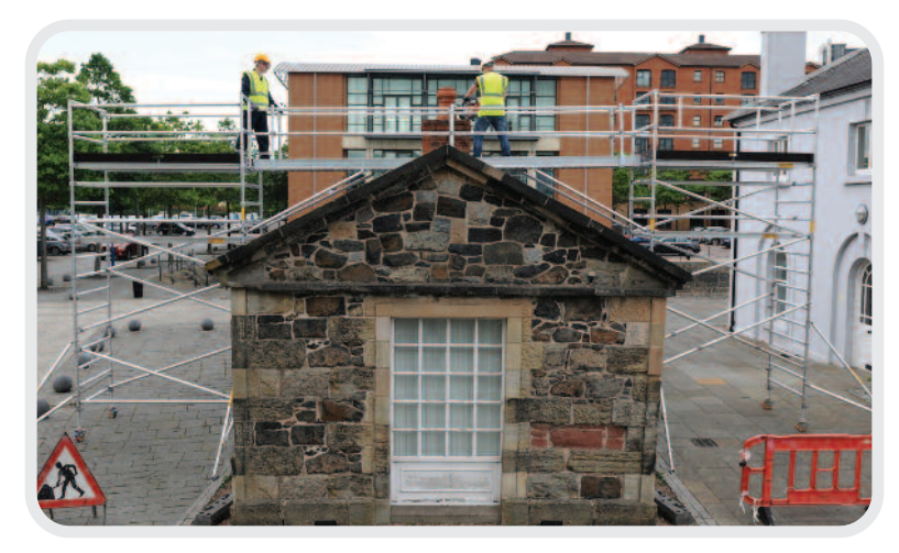
Spandeck links 2 towers for chimney maintenance in Belfast.