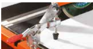
ADJUSTABLE CLAMPS FOR FIXING THE TILES