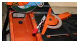
ANGULAR CUTTING GUIDE / RUBBER-COVERED TABLE